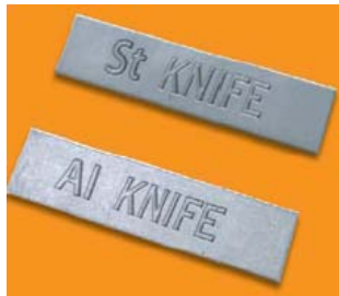
Medium Object Size (Knives)