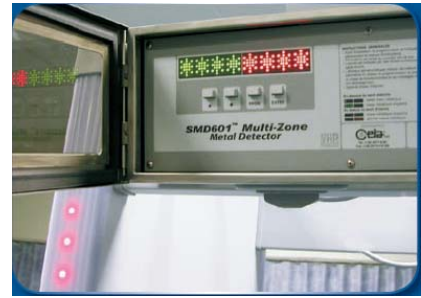
Anti-Vandalism Control Unit (IP65)