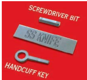
Small Object Size (Hard to find items) (Handguns)