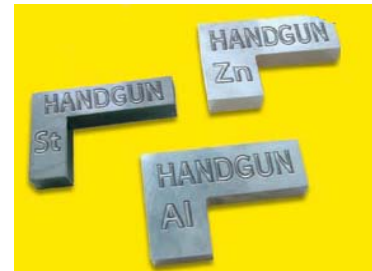
Large Object Size

A full-height light bar displays the horizontal location of the detected metal masses in transit. This results in rapid identification of threat and a reduction, or elimination, of the need for manual searches. The Anti-Vandalism Control Unit (IP65 in stainless steel) is incorporated into the structure of the Metal Detector.